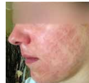
2 DAYS POST LASER

Analgesic and anti-inflammatory effects of A-PRP help to fight the pain and significantly improve the speed of wound healing after laser or chemical peel treatments.