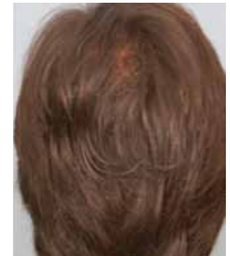
AFTER 3 treatments RegenACR Classic / Extra