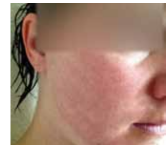
2 DAYS POST LASER + A-PRP